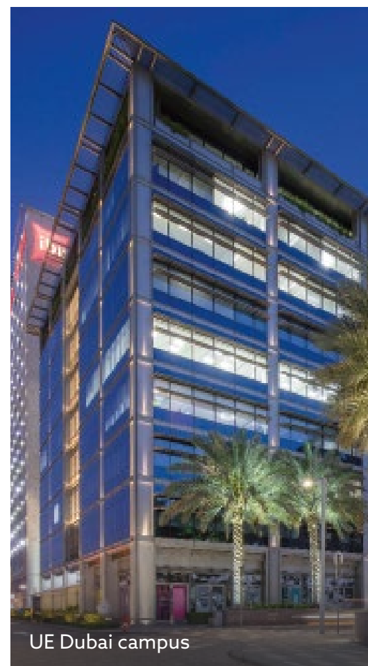
UE Dubai campus